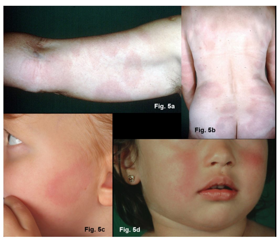
Figure 5: Multiple erythemata migrantia (MEM)

Fig. 5a and 5b: Pronounced erythemata migrantia on the right arm, approx. 40 more on the torso and lower extremities Fig. 5c: Oval erythema on the left cheek, many similar erythemas on the torso and upper leg a sign of early disseminated borreliosis Fig. 5d: Symmetrical redness on the cheeks of a 5-year-old girl with multiple erythemata migrantia on her trunk and extremities, accompanied by flu-like symptoms