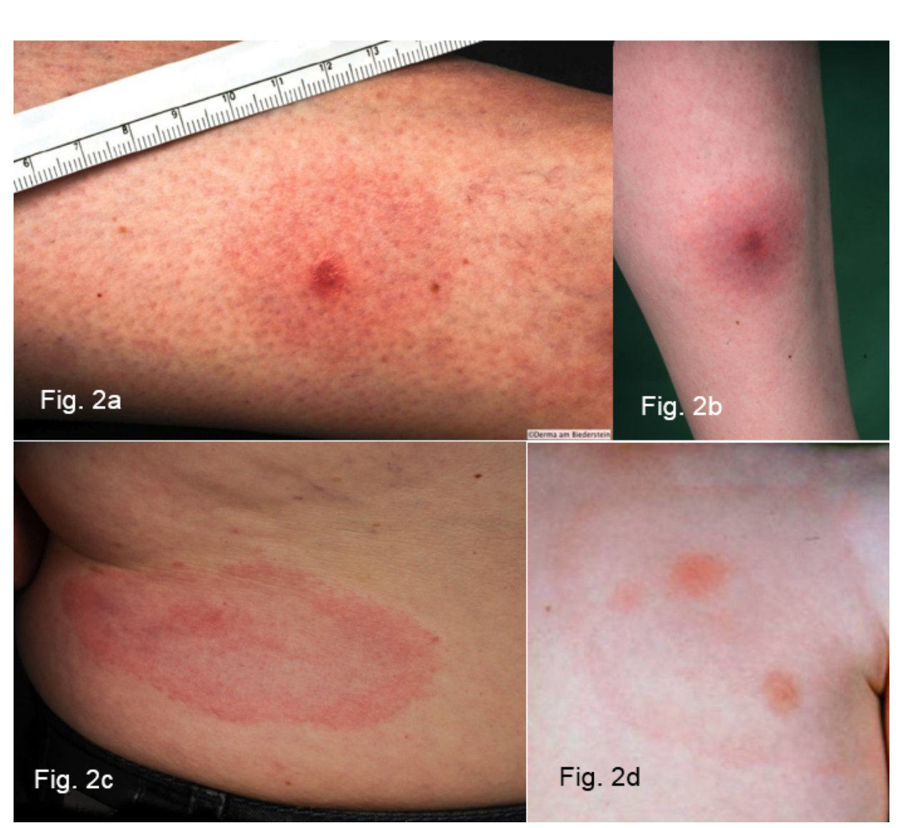
Figure 2: Clinical variations of erythema migrans Fig. 2a: Initial seronegative erythema migrans 1 week after tick bite DD reaction to insect bite; diameter 4.9 cm, progression under observation Fig. 2b: Seronegative erythema migrans, elevation of IgM antibodies occured 5 days after start of treatment

Fig. 2c: Typical marginated migrating erythema migrans