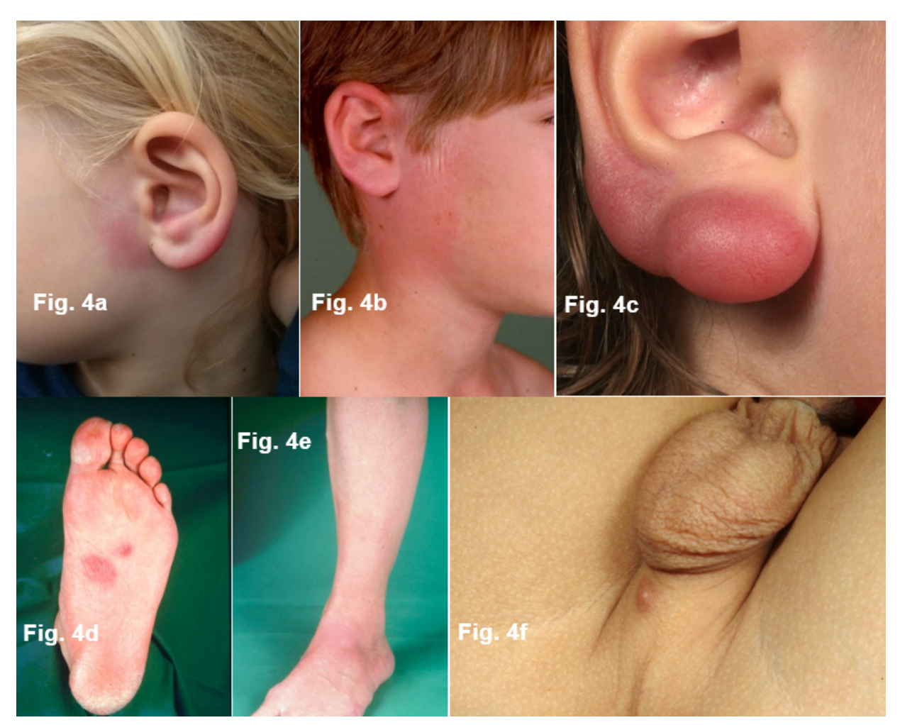
Figure 4: Borrelial lymphocytoma

Fig. 4a: Borrelial lymphocytoma preauricular and on the left earlobe Fig. 4b: Borrelial lymphocytoma on the right auricle near a non-marginated erythema migrans