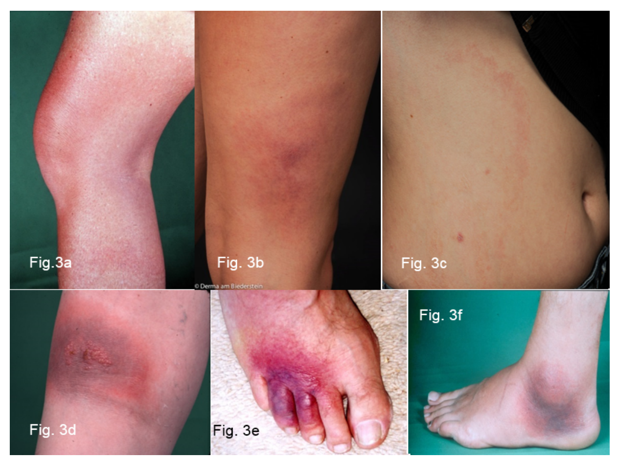
Figure 3: Variability of the erythema migrans Fig. 3a: Flaming red erythema chronicum migrans with radiculitis on the left leg, DD erysipelas Fig. 3b: Blotchy purple erythema chronicum migrans on the upper thigh for 3 months Fig. 3c: Large light-red arch-shaped erythema chronicum migrans on the abdomen Fig. 3d: Centrally vesicular erythema migrans Fig. 3e: Haemorrhagic bullous erythema migrans on the foot Fig. 3f: Purple, haemorrhagic, non-migrating erythema chronicum migrans on the outer ankle with joint swelling