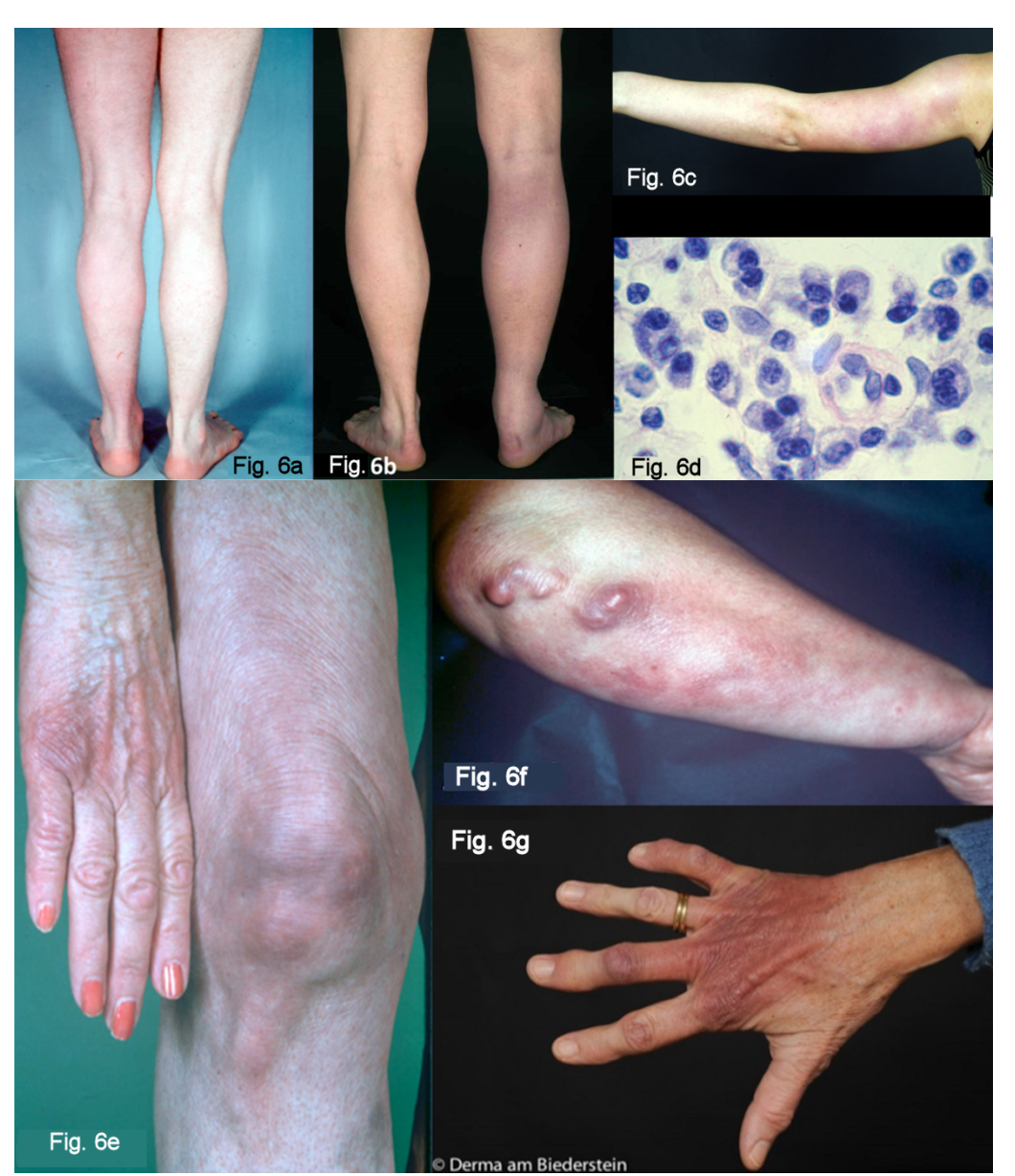
Figure 6: Late cutaneous manifestations