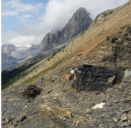
Scree slope site. Walcott quarry in the Burgess Shale, which beautifully preserves soft-bodied animals from shortly after the Cambrian explosion.

The reviewer is at the Department of Integrative Biology and Director of the Museum of Paleontology, University of California, Berkeley, CA 94720-4780, USA. E-mail: crmarshall@berkeley.edu